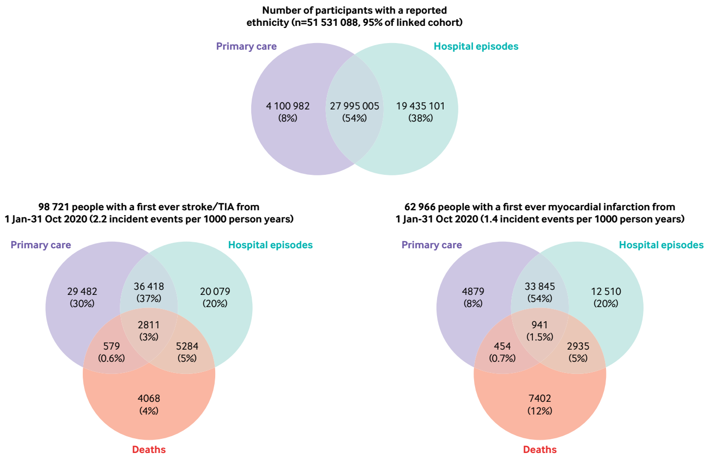
Fig 2 | Data sources reporting person level data on ethnicity, incident stroke or transient ischaemic attack (TIA), and incident myocardial infarction

with covid-19 on the death certificate, 35 the data from our linked cohort concurs with those from relevant cumulative counts of people with covid-19 (supplementary table 8).